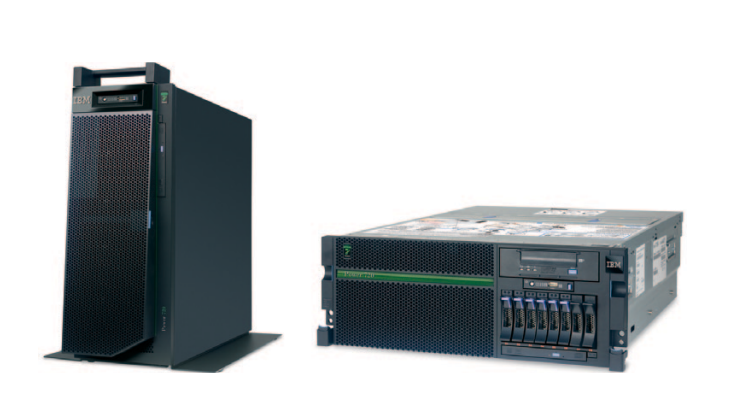
Power 720 Express tower and rack-mount servers

Learn why so many clients are moving to IBM Power Systems<sup>™</sup>. Reliable and secure, the Power 720 Express is a one-socket server that supports up to eight POWER7+<sup>™</sup> cores in a flexible 4U rack-optimized or tower form factor. The performance, availability, and flexibility of the Power 720 can enable you to focus on running your business, utilizing a proven solution from thousands of ISVs that support the AIX, IBM i and Linux operating systems.